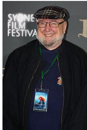
Thomas Keneally Australian Writer