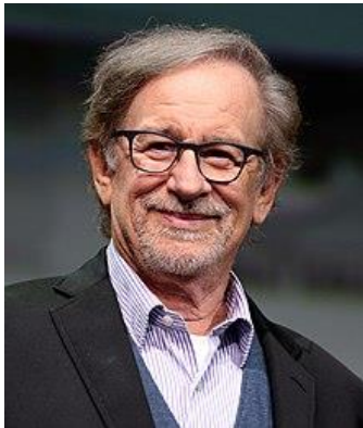
Stephen Spielberg American Movie Director